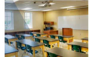
Schools and Academies